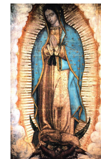
Our Lady of Guadalupe: Mexico, Known for Love