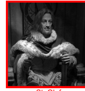
St. Olaf: Pictured in Epcot's Norway, Known for Right Judgment