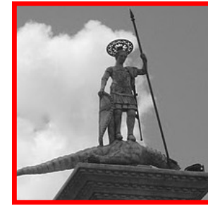
St. Theodore of Amasea: Pictured in Epcot's Italy, Known for Faithfulness