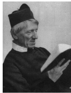
Cardinal Newman: UK, Known for Wisdom