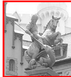
St. George: Pictured in Epcot's Germany, Known for Generosity

Below you see the pictures of the 3 Saints that appear in Epcot and saints from each Epcot country. Finally—is the place held for you—Dare to be a SAINT!