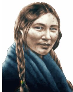
Bl. Kateri Tekakwitha: USA, Known for Self-Control