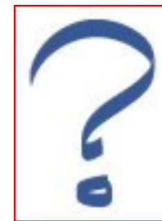
What will you be known for?