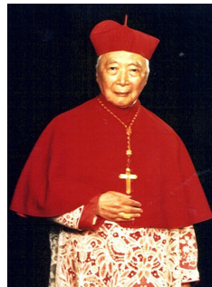
Cardinal Kung: China, Known for Courage