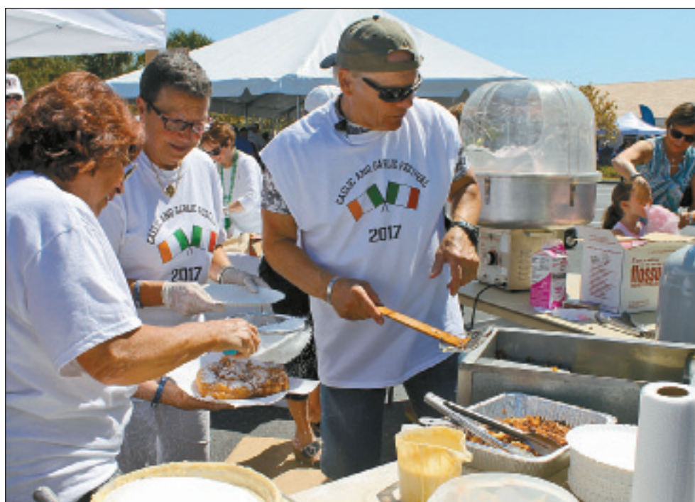
There are plenty of food and drink choices at parish festivals, as seen here at the Gaelic and Garlic Festival held annually in March at St. John the Evangelist Parish in Naples.