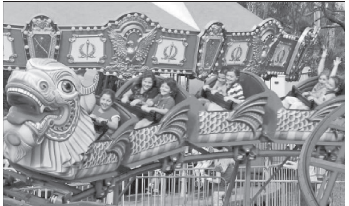
Children enjoy a ride at the St. Helen's Harvest Festival held in historic Dodgertown in Vero Beach. This year's 53rd annual festival will be held Nov. 16-19.

Oct. 27, preview day, $3 admission; Oct. 28-29, 8 a.m.-1 p.m., free admission Find something for everyone. Clothing, household items, linens, furniture, electronics, and more See ad on Page B3