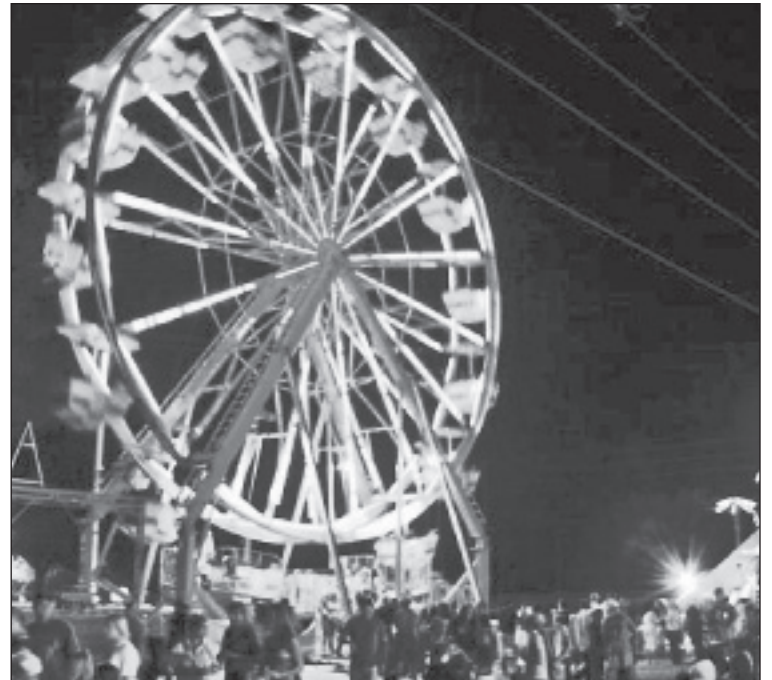
Ferris wheels, like this one at Holy Family's Southwest Fall Fest in Orlando held Oct. 26-29, are among rides typically seen at parish festivals.

stmatthewsale@gmail.com www.st-matthew-church.com Nov. 18, 9 a.m.-2 p.m. (Rain date Nov. 25) 130-plus vendors. Manicotti and bake sale